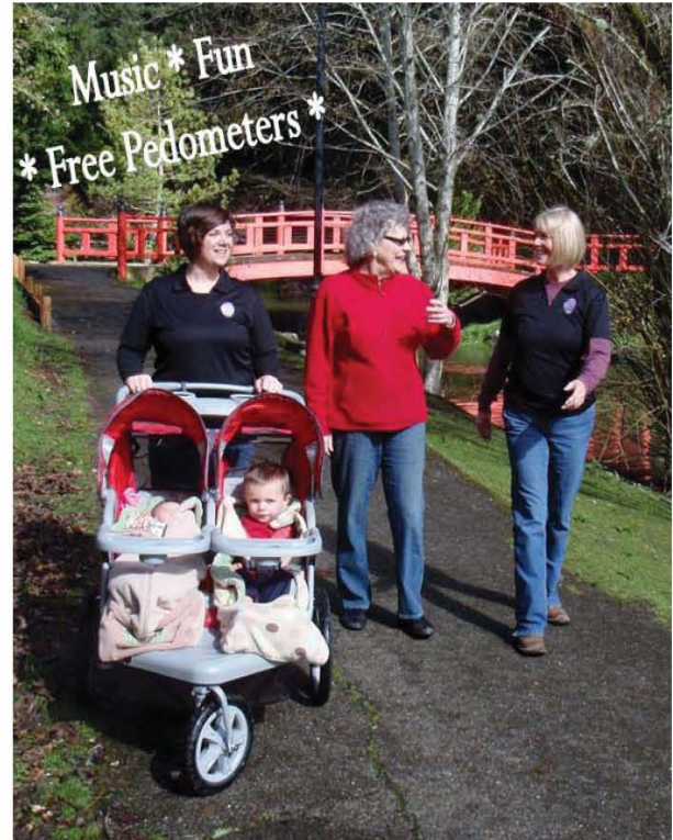
Stepping Up for Women's Health !