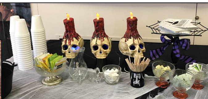
Haunted coffee table invites attendees to sit for a spell.